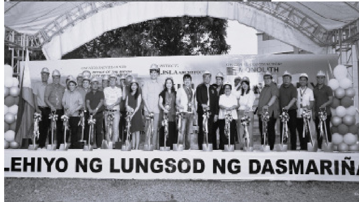
LEHIYO NG LUNGSOD NG DASMARIÑAS