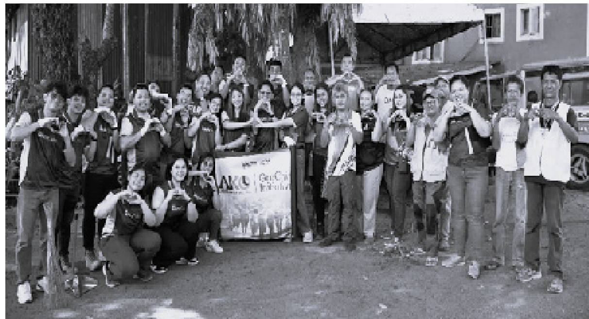
Various divisions and departments of MPT South, including Communication and Stakeholder Management, Tollway Development Engineering - Project Management Department, and Project Support Services Department, collaborated with project contractors, barangay officials, and volunteers to execute the clean-up activities effectively.

collaborated with project contractors, barangay officials, and volunteers to execute the clean-up activities effectively.